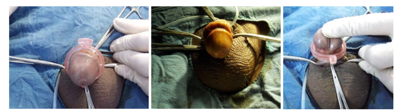
Placement of the outer ring and locking it