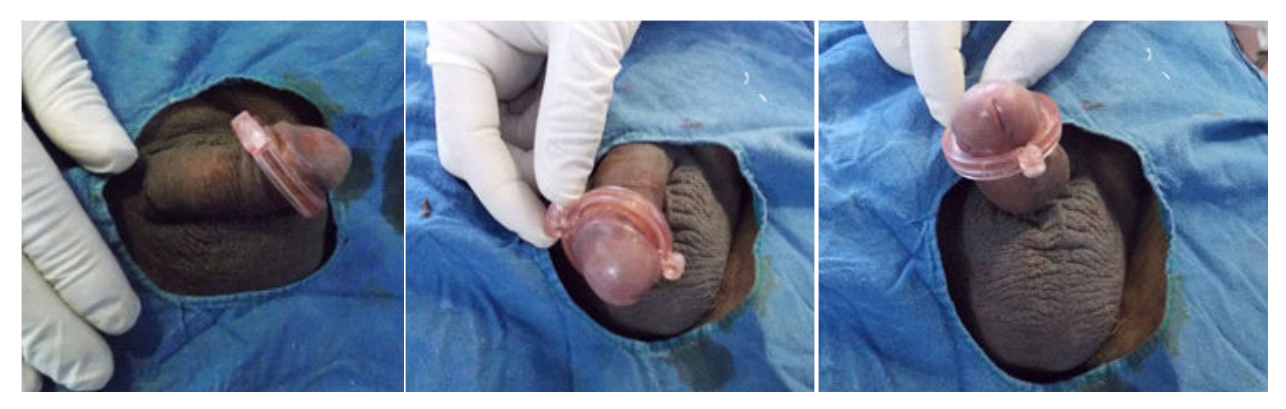
Look of the Shang Ring in place.