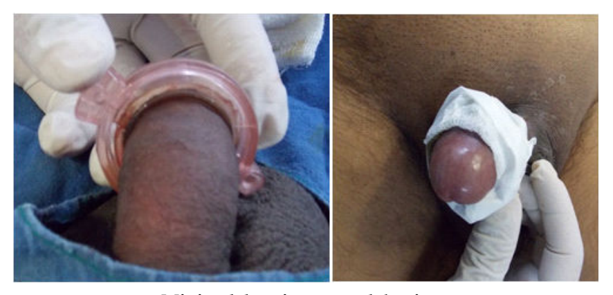
Minimal dressing around the ring.